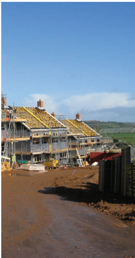
Twenty homes for rent under construction at Colyton, Devon.

Preparing for the planning application is one of the most time consuming elements of the process. There are numerous and often lengthy consultations needed between all partners to make sure the evidence, design, cost and location of the development deliver the right homes in the right place.