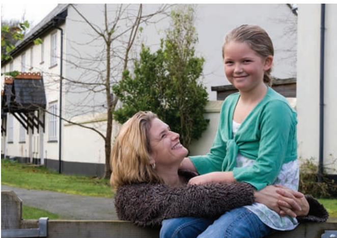
Two of 10 homes built in two phases at Brook Lane Cottages, Widecombe-in-the-Moor, Devon