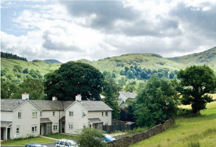
Barraclough Fold, Glenridding, Cumbria where nine affordable homes were provided as a priority for local people.